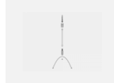
121-00300, N wire suspension 2000mm