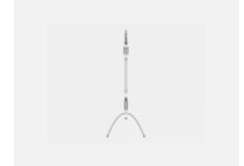
121-00301, N wire suspension 4000mm