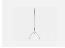
121-00300, N wire suspension 2000mm