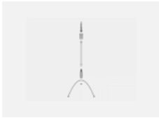
121-00302, N wire suspension 6000mm