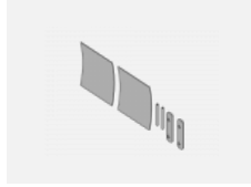
121-00200, N straight connector