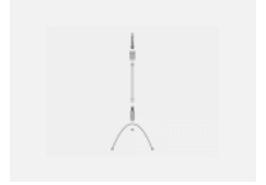
121-00301, N wire suspension 4000mm