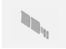
121-00200, N straight connector