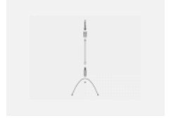
121-00301, N wire suspension 4000mm