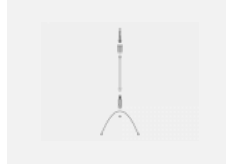
121-00300, N wire suspension 2000mm