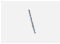
00-00352, K cable 3x0,75 2000mm