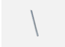
00-00364, K cable 5x1,5 4000mm