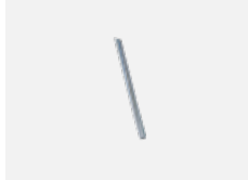
00-00365, K cable 5x1,5 6000mm