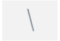
00-00363, K cable 5x1,5 2000mm