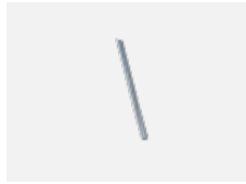
00-00358, K cable 3x0,75 4000mm