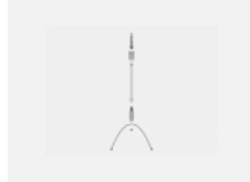
121-00300, N wire suspension 2000mm