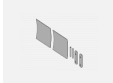
121-00200, N straight connector