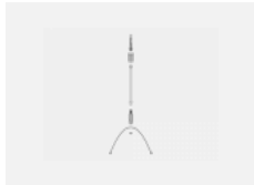
121-00302, N wire suspension 6000mm