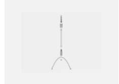
121-00301, N wire suspension 4000mm