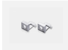
00-20700, W 2 pcs of wall fastening Lipo/Lina