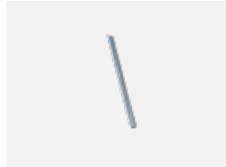
00-00363, K cable 5x1,5 2000mm