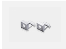
00-20700, W 2 pcs of wall fastening Lipo/Lina