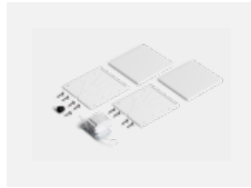
00-20103, W 2xend cap - plastic, 5- conductor terminal box, grommet; Lipo80/Lina80