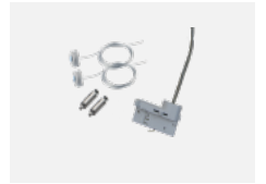
00-51300, B set for suspension into 3-phase track, non- dimmable luminaires