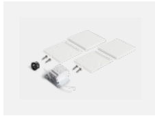
00-20101, B 2xend cap - metal, 5- conductor terminal box, grommet; Lipo80/Lina80