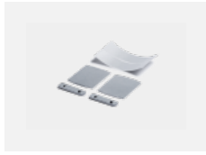
00-00200, N straight connector