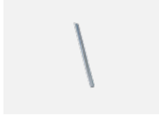
00-00363, K cable 5x1,5 2000mm