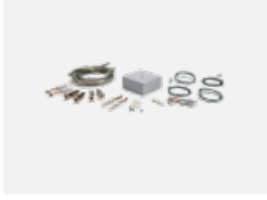
00-00333, S suspension set 2000mm, 4 pcs.of wires, cable 5x0,75mm, ceiling cup