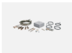
00-00333, W suspension set 2000mm, 4 pcs.of wires, cable 5x0,75mm, ceiling cup