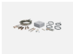
00-00333, W suspension set 2000mm, 4 pcs.of wires, cable 5x0,75mm, ceiling cup