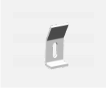
109-0001, F wall fastening