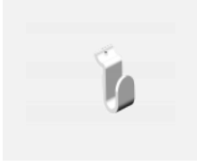
109-0003, W hook