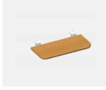
109-0004, WD shelf