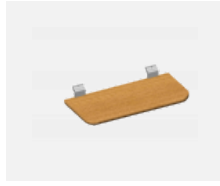
109-0004, SD shelf