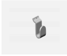
109-0003, S hook