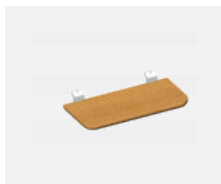
109-0004, WD shelf