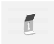
109-0001, F wall fastening