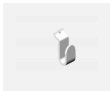
109-0003, W hook