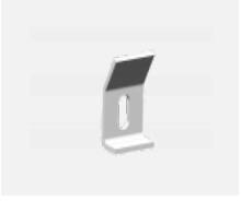
109-0001, F wall fastening