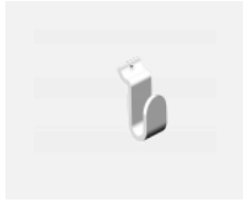
109-0003, W hook