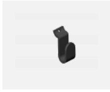
109-0003, B hook