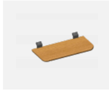
109-0004, BD shelf