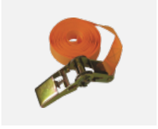
108-0004 Tie-down strap for INDI circle