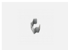
108-0002, F wall fastening for 108-301K