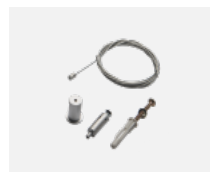
01-0007, N wire suspension 2000mm