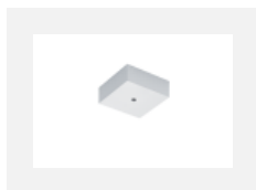
00-00370, S ceiling cup 80x80x32mm