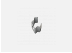
108-0002, F wall fastening for 108-301K