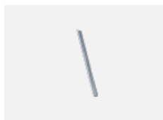
00-00352, K cable 3x0,75 2000mm