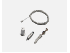
01-0007, N wire suspension 2000mm