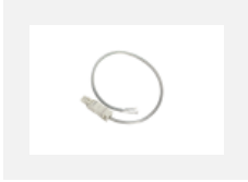
101-0013, W transparent cable 3x 0,75 mm, 2m with WAGO connector