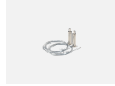
101-0008, N wire suspension 6000 mm, 2 wires