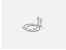
101-0002, N wire suspension 2000 mm, 2 wires