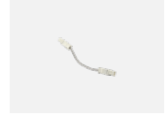
101-0011 cable 3x 0,75 mm with WAGO connector