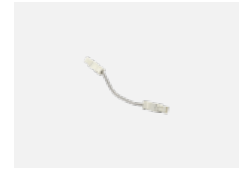
101-0011 cable 3x 0,75 mm with WAGO connector