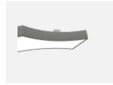
101-0001, B accessory for creating of distance between mounting surface