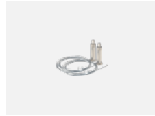
101-0007, N wire suspension 4000 mm, 2 wires