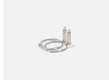
101-0008, N wire suspension 6000 mm, 2 wires