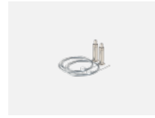
101-0008, N wire suspension 6000 mm, 2 wires