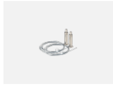
101-0002, N wire suspension 2000 mm, 2 wires