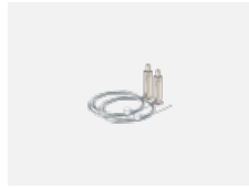
101-0007, N wire suspension 4000 mm, 2 wires