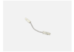
101-0012 cable 5x 0,75 mm with WAGO connector