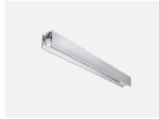
00-21301, W Lipo80-S, Lina80-S - pendant profile for track luminaires; l = 2242mm