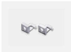
00-20700, W 2 pcs of wall fastening Lipo/Lina