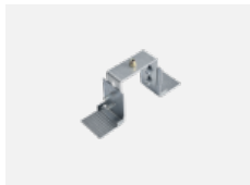
00-20900, F bracket for installation of suspended type of profile as recessed trimless