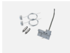
00-51300, W set for suspension into 3-phase track, non- dimmable luminaires