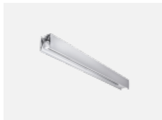
00-21300, W Lipo80-S, Lina80-S - pendant profile for track luminaires; l = 1122mm