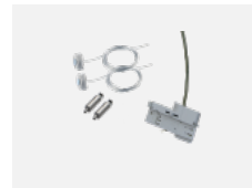
00-51301, W set for suspension into 3-phase track, dimmable luminaires