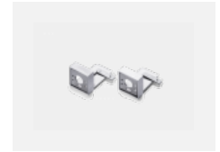
00-20700, W 2 pcs of wall fastening Lipo/Lina