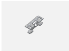
00-00600, F ceiling fastening for luminaires 132-5xxK, 04-2000x, 05-2000x, 09-200x - 1 piece