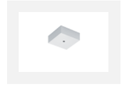
00-00370, W ceiling cup 80x80x32mm