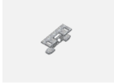
00-00600, F ceiling fastening for luminaires 132-5xxK, 04-2000x, 05-2000x, 09-200x - 1 piece