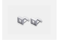
00-20700, W 2 pcs of wall fastening Lipo/Lina