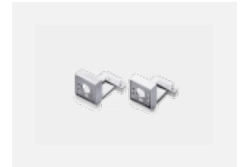
00-20700, W 2 pcs of wall fastening Lipo/Lina