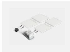
00-20100, W 2xend cap - metal, 3- conductor terminal box, grommet; Lipo80/Lina80