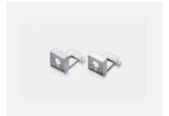
00-20700, W 2 pcs of wall fastening Lipo/Lina