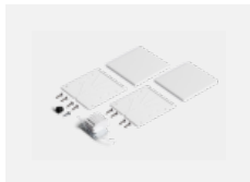
00-20103, W 2xend cap - plastic, 5- conductor terminal box, grommet; Lipo80/Lina80