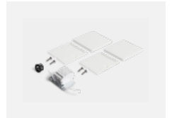
00-20101, W 2xend cap - metal, 5- conductor terminal box, grommet; Lipo80/Lina80