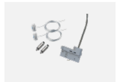
00-51300, W set for suspension into 3-phase track, non- dimmable luminaires