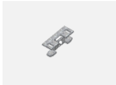
00-00600, F ceiling fastening for luminaires 132-5xxK, 04-2000x, 05-2000x, 09-200x - 1 piece