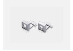
00-20700, W 2 pcs of wall fastening Lipo/Lina