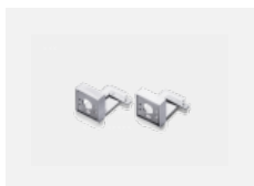
00-20700, W 2 pcs of wall fastening Lipo/Lina