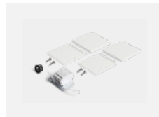
00-20101, W 2xend cap - metal, 5- conductor terminal box, grommet; Lipo80/Lina80