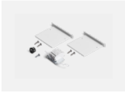
00-00101, S 2x end cap - metal, 5- conductor terminal box, grommet; Lipo80