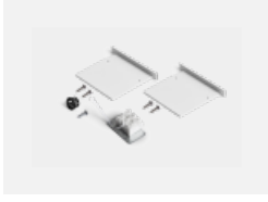
00-00100, S 2xend cap - metal, 3- conductor terminal box, grommet; Lipo80