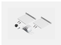
00-00101, W 2xend cap - metal, 5- conductor terminal box, grommet; Lipo80