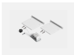
00-00100, W 2xend cap - metal, 3- conductor terminal box, grommet; Lipo80