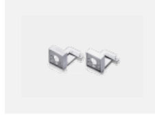
00-20700, B 2 pcs of wall fastening Lipo/Lina