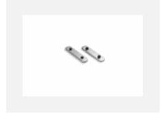
04-00200, N straight connector