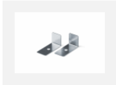
04-01200, F Accessory for gear-tray release