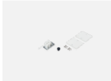
04-20100, S 2xend cap - metal, 3- conductor terminal box, grommet