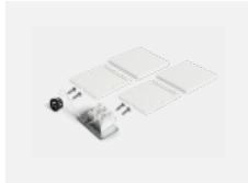
04-20102, S 2xend cap - plastic, 3- conductor terminal box, grommet