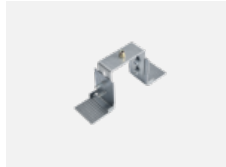
04-20900, F bracket for installation of suspended type of profile as recessed trimless